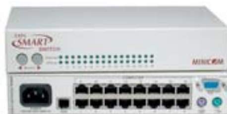
8 - Port Smart CAT5 KVM Switch