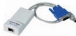
RIC - SUN Cable