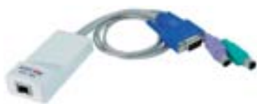
RIC - PS/2 Cable