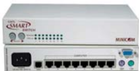
8 - Port Smart CAT5 KVM Switch

Platform-specific RIC (Remote Interface Connection) cables to support PS/2, USB and SUN.