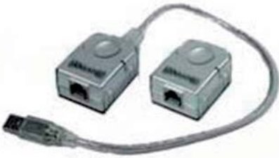
Micro Sized - Small Form Factor Plug and Play Installation

Multifunctional system with three user options